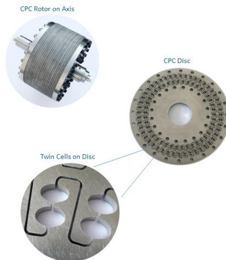
Figure 2. CPC column design

The actual CPC column or rotor is composed of a stacked series of stainless steel discs that rotates on an axis, providing the centrifugal force to hold the stationary phase on the column ( Figure 2 ). Each disc is engraved with hundreds of twin cells. These twin cells act similarly to the separatory funnel example, where the heavier mobile phase passes out one set of cells and is pumped into the next when operating in descending mode, repeating the separation hundreds of times. Molecules with greater affinity for the heavier mobile phase will move faster through the CPC column and elute earlier. This design provides better retention of the stationary phase, while allowing the use of higher flow rates for faster separations and increased productivity